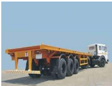
40 Ft Trailer